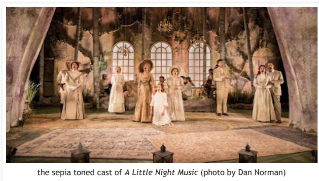
the sepia toned cast of A Little Night Music

A Little Night Music is one of the best musicals from one of our best living composers, brought to life by one of #TCTheater's best interpreters of music-theater. Continuing through March 3 at the Ritz Theater in Northeast Minneapolis.