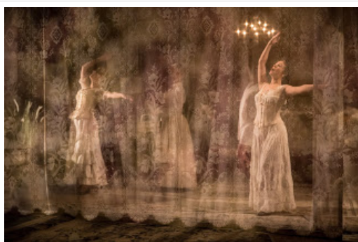
waltzing behind the curtain